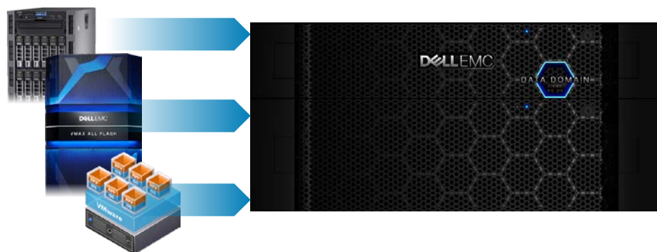
Decouple backup software from data path

As storage integrated data protection for the software-defined data center, Data Protection Suite for Applications provides management via automated provisioning and self-service copy creation, visibility of storage, copies, host and data paths, application governance and centralized oversight of the copy data ecosystem to reduce risk and increase protection efficiency.