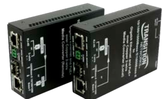
E02PSE4052-111 & E02PD4052-111