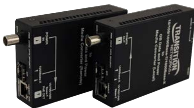
EOCPSE4020-110 & EOCPD4020-110