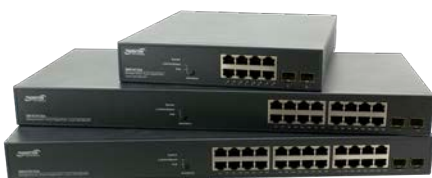
SM8TAT2SA, SM16TAT2SA, SM24TAT2SA