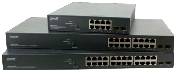
SM8TAT2SA, SM16TAT2SA, SM24TAT2SA