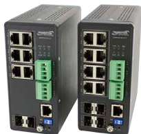
SISPM1040-362-LRT & SISPM1040-384-LRT-C