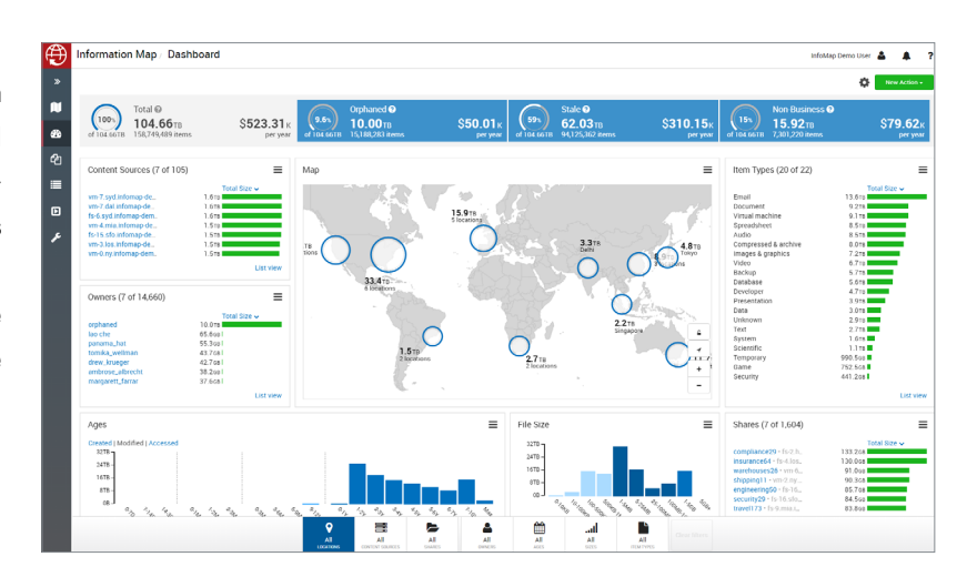
Figure 2. Veritas Information Map integration renders your information environment in visual context and guides users towards unbiased, information-governance decision making.

Backup Exec's integration with Veritas™ Information Map renders your information environment in visual context and guides users towards unbiased, information-governance decision making. Using the Information Map's dynamic navigation, customers can identify areas of risk, areas of value and areas of waste across their storage environment and make decisions which help reduce information risk and optimize information storage.